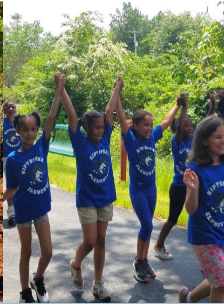
Photos left to right: Historic railroad, CBES Between the Waters Bike Tour, Kiptopeke Elementary School at the Southern Tip Hike & Bike Trail ribbon cutting. Front: CBES Between the Waters Bike Tour